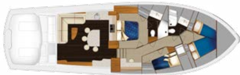
Interior Arrangement with Optional Tackle Center and Optional Bow Stateroom Arrangement