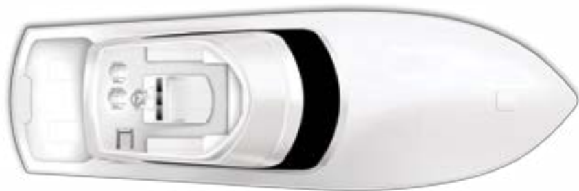
Standard Flybridge Arrangement with Optional Companion Helm Chair