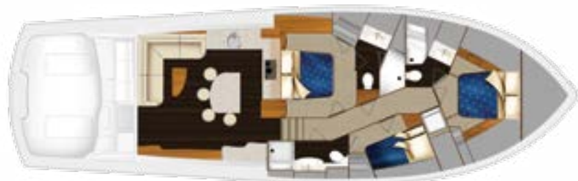
Interior Arrangement with Optional Third Head