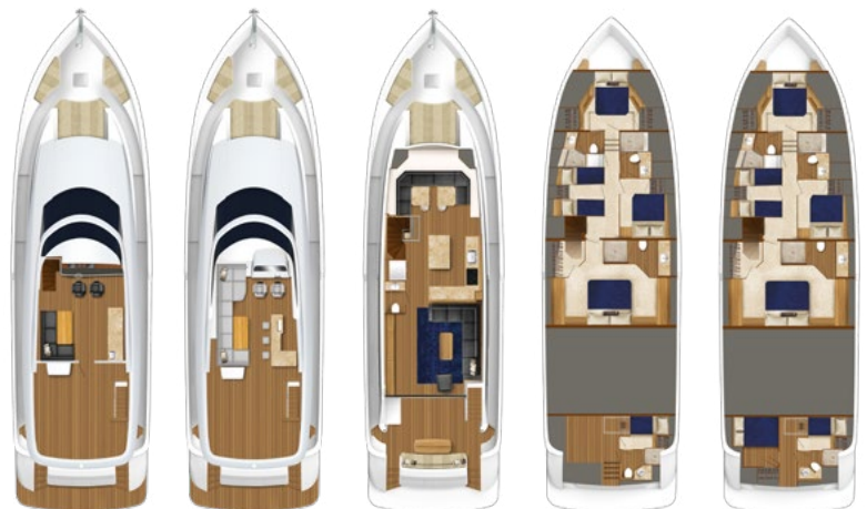
ENCLOSED FLYBRIDGE ARRANGEMENT

The specification measurements are approximations and subject to variance.